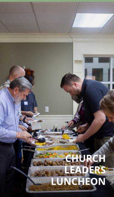
CHURCH LEADERS LUNCHEON