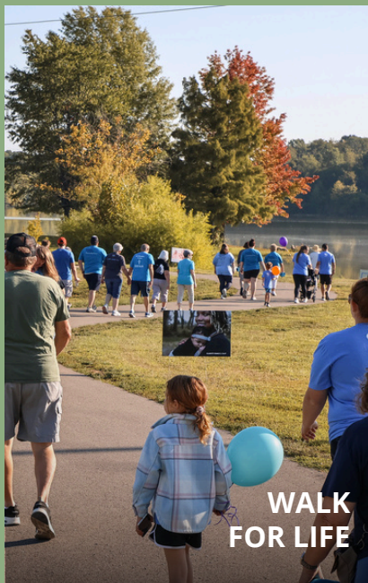
WALK FOR LIFE